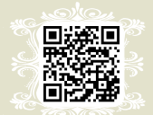
Exhibition Trail details

Part of the Ellen Hutchins Festival 2016 organised by the Bantry Historical Society, National Parks and Wildlife Service and members of the Hutchins family.